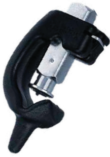
CK KABIFIX Cable Stripper TL-FK28-430004