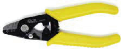
JCS-WB Tri-Hole Fibre Optic Stripper TL-STRIP-TRI

At JCS-WB we understand the demand for companies and installers to set up with the right tools. That's why JCS-WB offers a comprehensive range of tooling that will ensure you have the right tool for the right job.