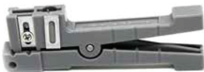
JCS-WB Buffer Tube Stripper 0-3.2mm Grey TL-STRIP-45-162