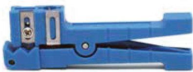
JCS-WB Buffer Tube Stripper 3.2-5.6mm Blue TL-STRIP-45-163