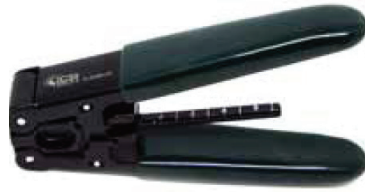
JCS-WB FTTH Flat Drop Optical Cable Stripper TL-STRIP-FD