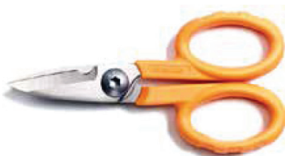
JCS-WB Kevlar Shears TL-KEVSHEAR