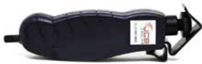
JCS-WB Round Cable Stripper 4.5mm - 25.4mm TL-STRIP-RND