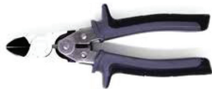
JCS-WB 6.7" Diagonal Compound Action Cutter TL-CC-6.7D